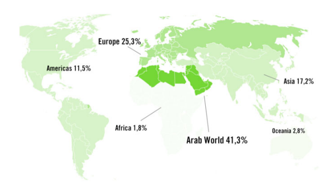
Arrivals by region in the year 2010

is simple: Even during the shortest holiday, anything is possible.