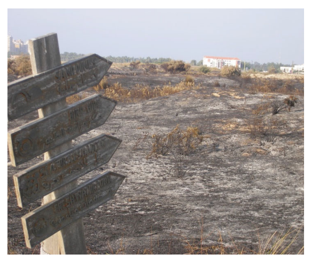
After a fire in the nature reserve of Tyre.

investments to rebuild. According to statements of the environmental department of the World Bank, in the future the cost of climate change for Lebanon could amount to 500 million dollars a year. <sup>19</sup> In addition to the cost of damaged and destroyed infrastructure, this calculation includes the estimated expenses for adaptation and mitigation measures and