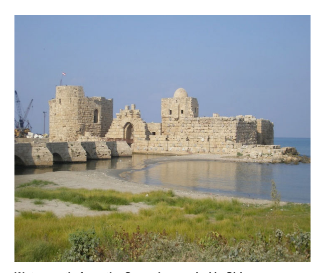
Water castle from the Crusaders period in Sidon.

"The 44 Places to Go."<sup>2</sup> Moreover, Beirut is also a favored destination for medical tourists from all over the world. The offers range from cosmetic surgery to organ transplantation. The combination of different factors such as well-trained doctors, moderate prices, anonymity and comparatively liberal laws especially attract foreign customers.<sup>3</sup>