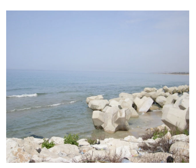
Tetrapods off the coast of Tyre.

Ministry of Environment (MoE). Among other things, it calls for promoting sustainable tourism. However, so far it has been barely implemented nationwide. It is precisely the development of alternatives which offers a great opportunity for the tourism industry. In this way, not only could a higher seasonal adjustment be achieved, but also new audiences and markets could be opened up.