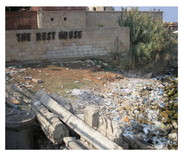
Garbage beside a restaurant in front of the sea in Sidon.