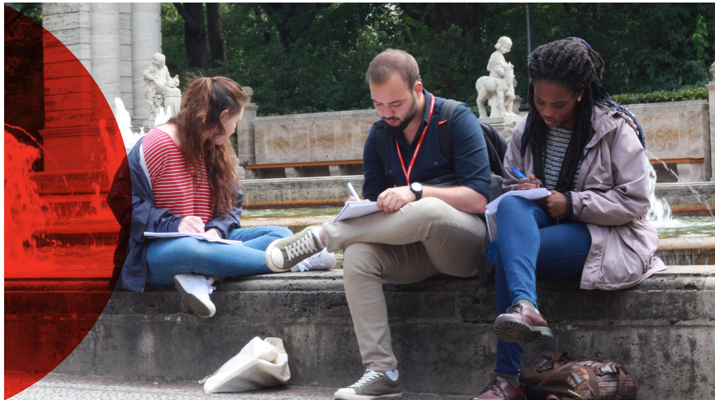
Student Group at Bard College Berlin.

In conclusion, it can be said that non-formal education is a promising yet underfunded sector in Lebanon when it comes to refugees. Primarily, the non-formal education sector in Lebanon exists largely for primary and secondary school students from Syria. For example, 75,000 Syrian children attend Syrian-led non-formal education centers, which have so far shown promising impact (Hayes et al. 2019). Hayes, McGhee, and Garland (2019) recommend applying non-formal education values and approaches to the higher education sector for students whose education was disrupted in Syria. There is evidence that non-formal education may be emerging as a bridge or support to higher education for displaced students in Lebanon, as well. A number of organizations and institutions, ranging from scholarship providers to universities themselves, are beginning to recognize that providing non-formal education and other supplementary forms of support to increase the likelihood of Syrian students entering and remaining in higher education.