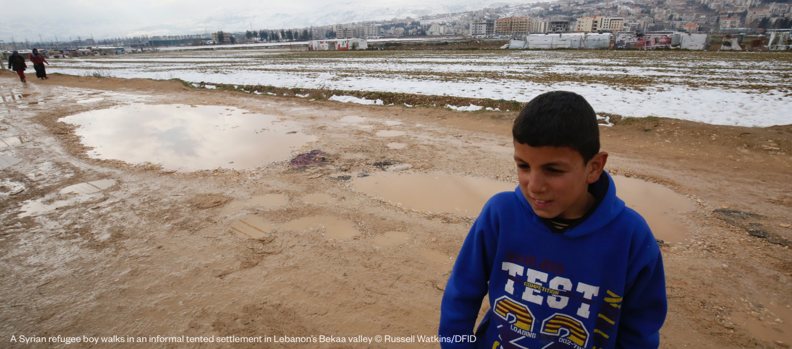
A Syrian refugee boy walks in an informal tented settlement in Lebanon's Bekaa valley

during the lockdown due to their inability to pay the rent. An 18-year-old Syrian boy explained, 'The conditions are difficult in particular during this period of time [the lockdown]. It is difficult more than I can describe to you. I am the main breadwinner in my family and I am not working and we do not have money. I borrow money when I can to get food for my family and on top of everything we were evicted from our house, we moved to small house with two rooms only and we are 11 members in my family.'