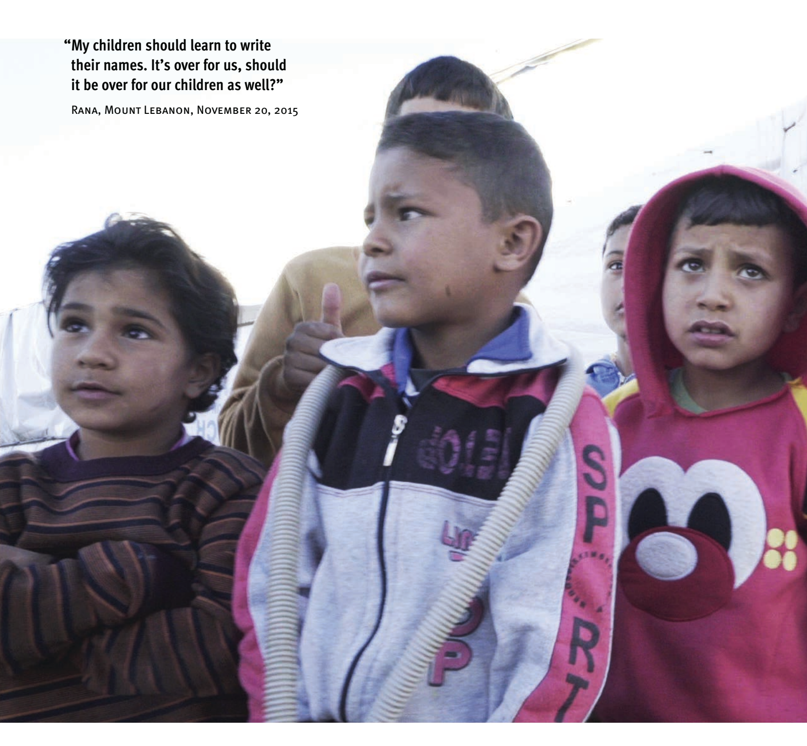
Syrian children in an informal refugee camp in the Bekaa Valley.