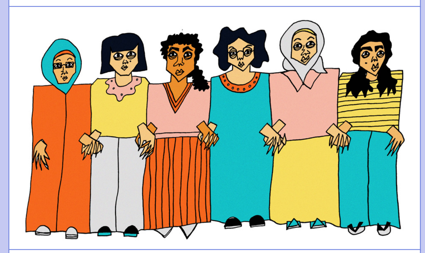
Report on Sexual and Gender Based Violence in Lebanon